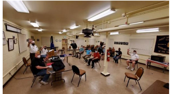
Photo Highlights VFW Post 6785